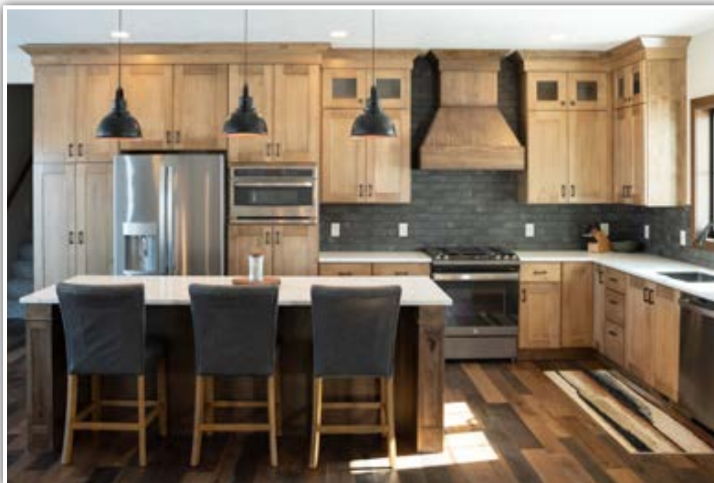
Murphy Company provides cut-to-size panel solutions to the cabinet, fixture, institutional, and industrial products industries.