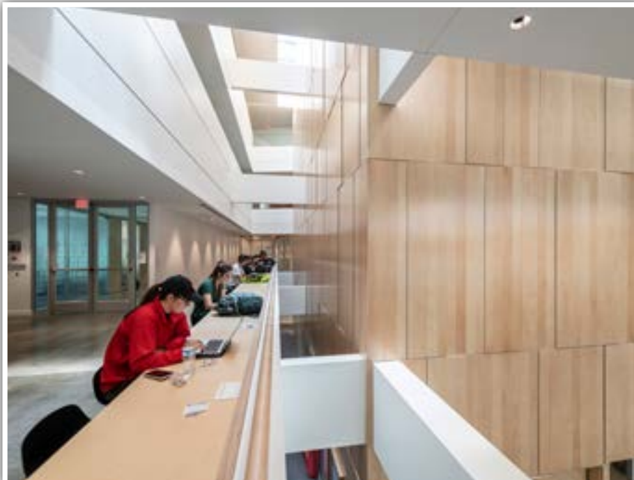
PureBond® hardwood plywood in the Carl H. Lindner College of Business at the University of Cincinnati.