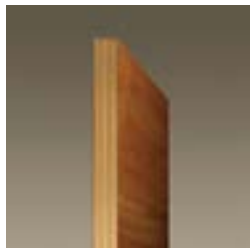
Pick Your Substrate