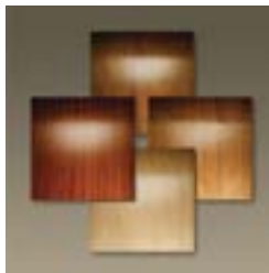
Choose Your Finish