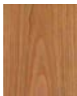
Cherry, American Black

Some of the more commonly used veneers are illustrated below.