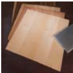
Select Your Veneer